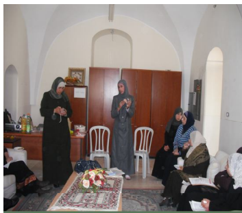
Community lecture

The Sunrise Group ladies attended a lecture about "cervical cancer" given by the Health Educator at Family Planning Assoc.