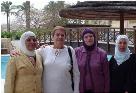
Mother's Day in Jericho

As always we like to share our news, activities and achievements with you, our friends, to keep you posted on what is happening. Patient's Friends Society- Jerusalem celebrated Mother's Day in March with a lovely "Sunrise Group" lunch at the InterContinental Hotel in Jericho who generously provided the group with a complimentary lunch.