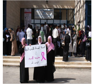
Health event in Ramallah

In October 2009, the first breast cancer awareness event in Palestine was held in Ramallah.