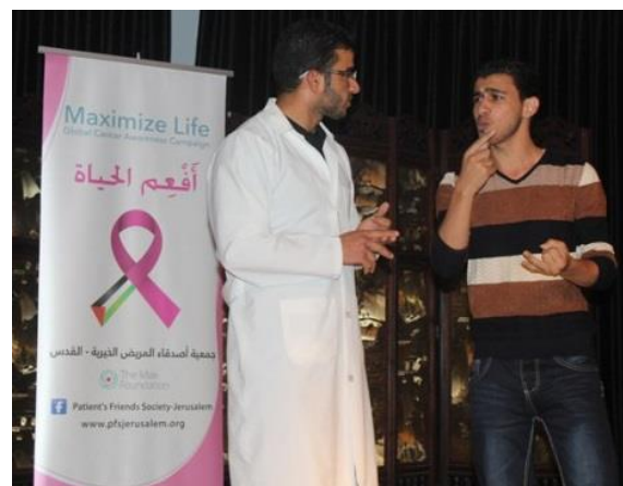
Pic: sketch ‘that disease’ @ awareness event in Hebron Univ